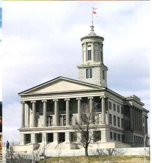
State Capitol building in Nashville