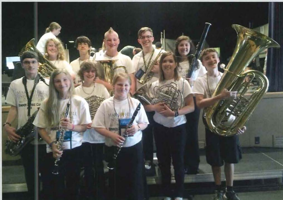
Guild scholarship winners at Mars Hill summer camp

Our heart-felt congratulations to these exceptional young musicians.